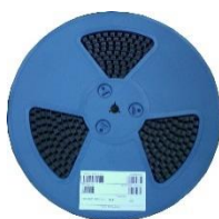
Tape & reel

※ Package 2 shown as below for reference.